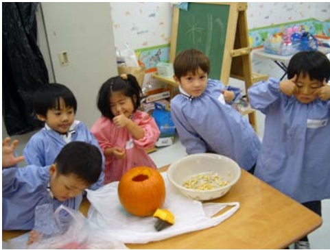
We are carving one of our pumpkins.