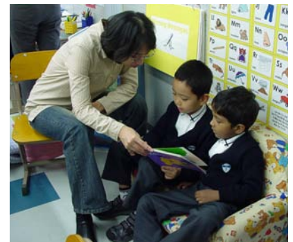
It's like looking into a mirror!

We're getting ready to start preparing for the winter performance, and it's hard to believe first term passed by so quickly! Kindergarteners are always curious and excited to see what's going to happen next. We are looking forward to the new fun adventures that await us next term.